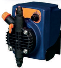
Chemical Dosing Pump