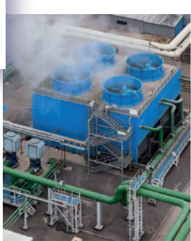
Boiler & Cooling Water Treatment Chemicals