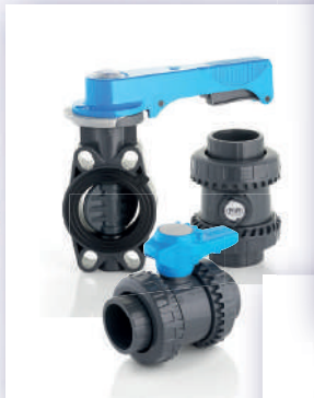
Manual Valves PVC-U